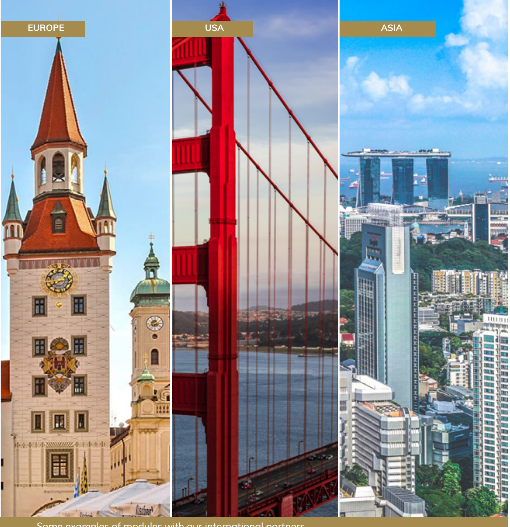
Some examples of modules with our international partners